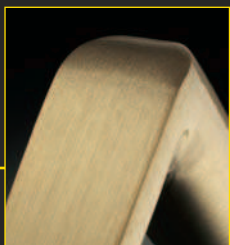
606 ■ ●