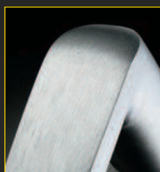
626 ■ ●