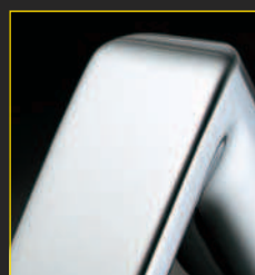
625 ■ ●