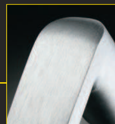
630AM ■ ●