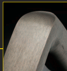
613 ■ ●