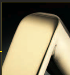
605 ■ ●