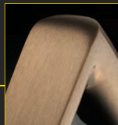
612 ■ ●